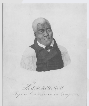
Mō‘ī Kamehameha I 1810 to 5/8/1819