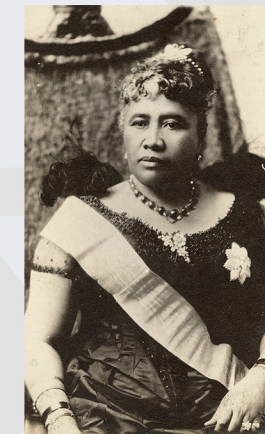
Mō‘ī Lili‘uokalani 1/29/1891 to 11/11/1917