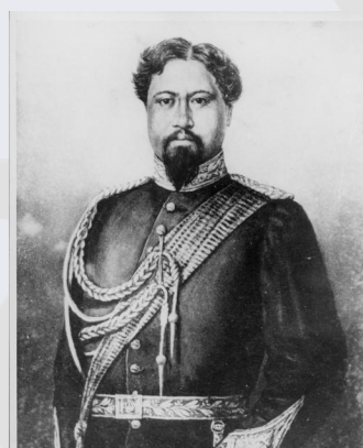
Mō‘ī Kapuāiwa Kamehameha V 11/30/1863 to 12/11/1872