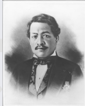
Mō‘ī Kauikeaouli Kamehameha III 6/6/1825 to 12/15/1854