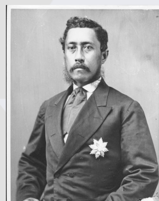
Mō‘ī Lunalilo 1/1/1873 to 2/3/1874