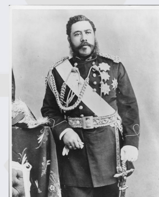
Mō‘ī Kalākaua 2/12/1874 to 1/20/1891